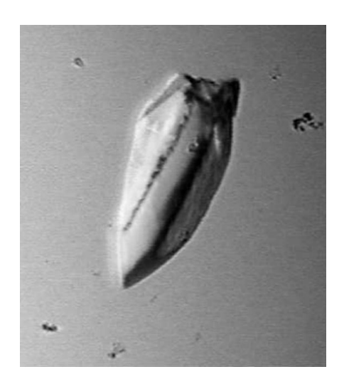
Figure 1 A typical crystal of Jun a 1. Dimensions are 0.46 × 0.18 mm

The crystal shown in Fig. 1 was soaked in reservoir solutions containing increasing amounts of glycerol to a maximum of 30%(v/v) over a period of 12 h. The crystal was then flash-cooled in liquid nitrogen and mounted on the goniometer in a nitrogen stream at 100 K. Cu K\alpha X-ray diffraction data were collected on a MacScience DIP 2030H image-plate system mounted on a MacScience M06HF rotating-anode generator equipped with Bruker Goëbel